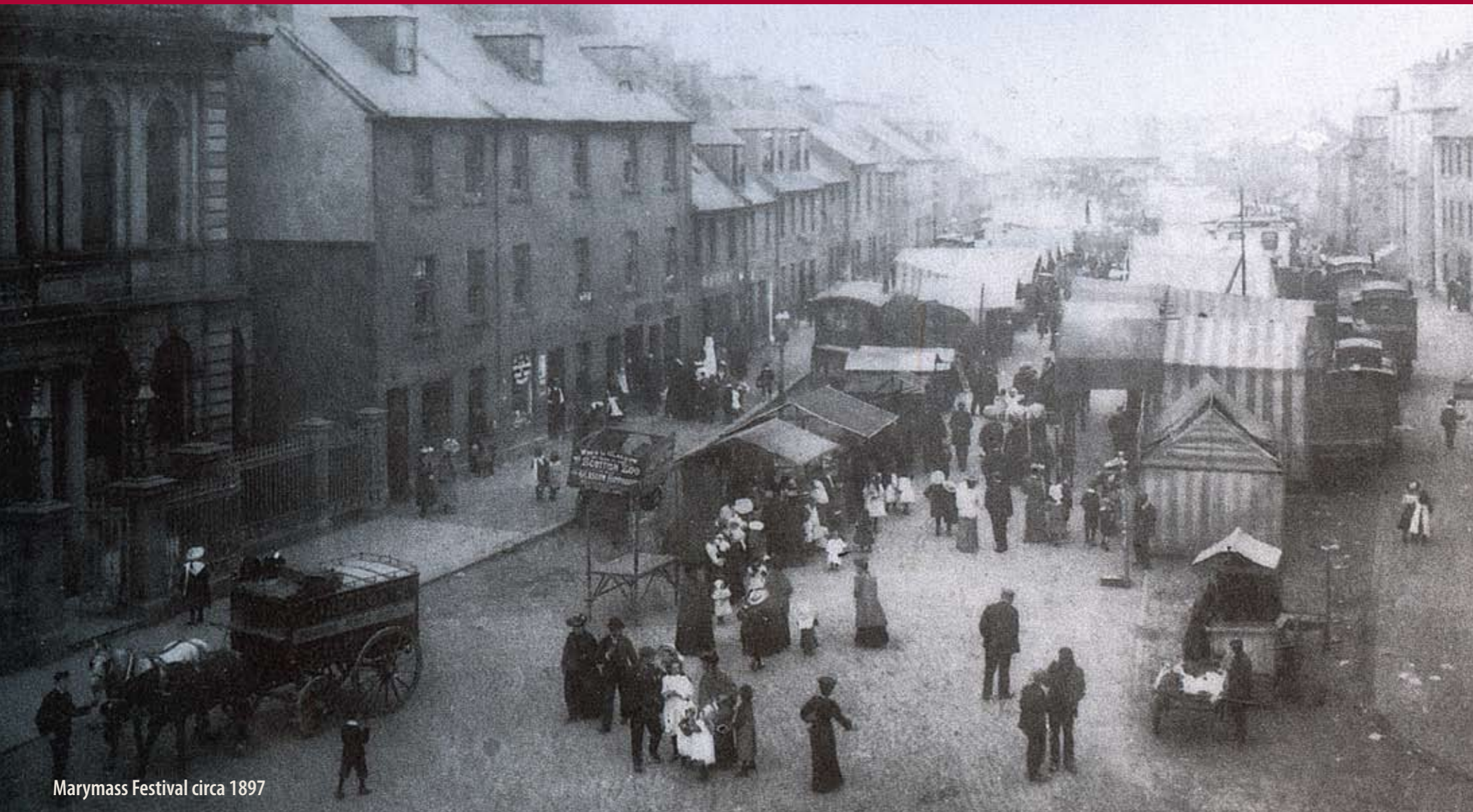
Marymass Festival circa 1897